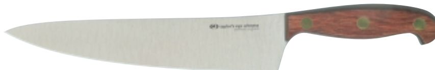
CHEF'S KNIFE (20cm / 8") W0004