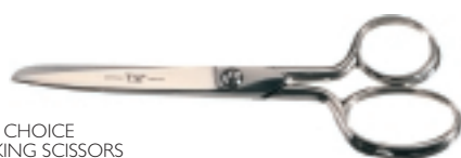
SHEFFIELD CHOICE DRESSMAKING SCISSORS (16cm / 6½", 18cm / 7", 20cm / 8¼") Nickel plated 1345