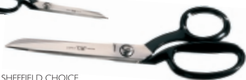
SHEFFIELD CHOICE TAILORS SHEARS (18cm / 7", 20cm / 8", 23cm / 9", 25cm / 10", 30cm / 12" Nickel plated) 1422