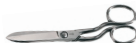
SHEFFIELD CHOICE HORSES SCISSORS (18cm / 7", 20cm / 8" Trowel Shank) 830 also available bent