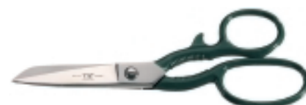
SHEFFIELD CHOICE KITCHEN SCISSORS (13cm / 7" All stainless, coloured handles) 7309