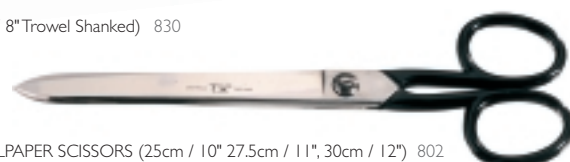
SHEFFIELD CHOICE WALLPAPER SCISSORS (25cm / 10", 27.5cm / 11", 30cm / 12") 802