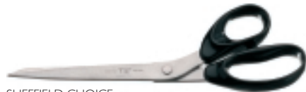
SHEFFIELD CHOICE LARGE TAILORS SHEAR (25cm / 10") 8470