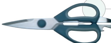
SOFT GRIP SCISSORS (20cm / 8") ULTK501