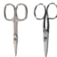
SHEFFIELD CHOICE NAIL SCISSORS (9cm / 3½" Nickel plated) Straight blade 2100 Straight blade, left handed 2100LH Bent Blade 2100b