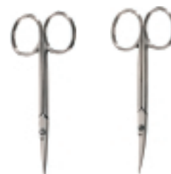
SHEFFIELD CHOICE MANICURE SCISSORS (9cm / 3½" Nickel plated) Straight blade 2995 Bent blade 2995b