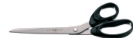
SHEFFIELD CHOICE LARGE KITCHEN SHEAR (25cm / 10") 8471