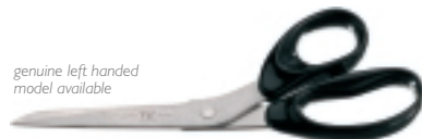
SHEFFIELD CHOICE HOUSECRAFT / DRESSMAKER SCISSORS (20cm / 8") 8469