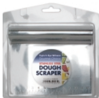
DOUGH SCRAPER GL00-02-106

A range of tools and gadgets, all ergonomically designed for ease of use, making food preparation simple, and ensuring the best possible results every time.