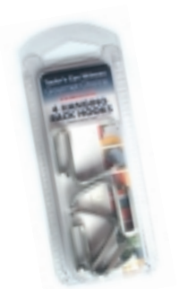
4 HANGING RACK HOOKS GL00-00-2176