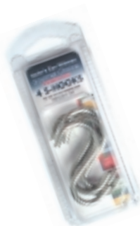
4 S-HOOKS GL00-73-0057