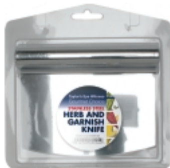
HERB AND GARNISH KNIFE GL00-02-101