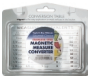
MAGNETIC MEASURE / CONVERTER GL00-02-107