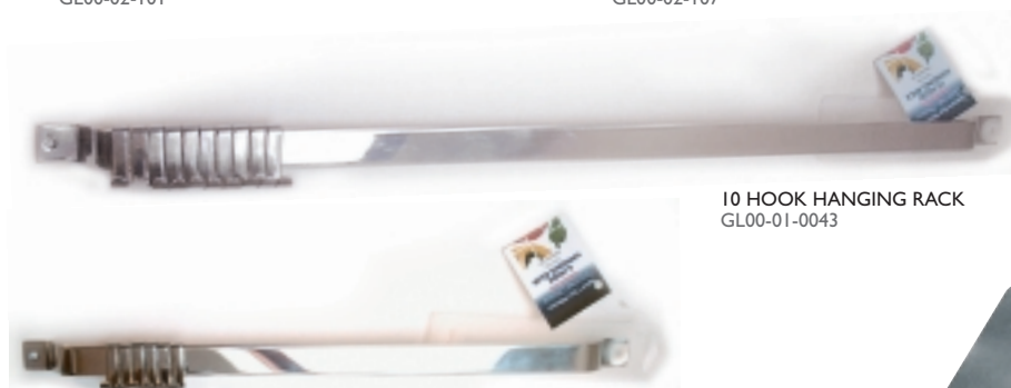
10 HOOK HANGING RACK GL00-01-0043