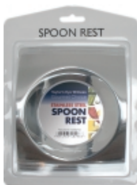
SPOON REST GL00-02-103