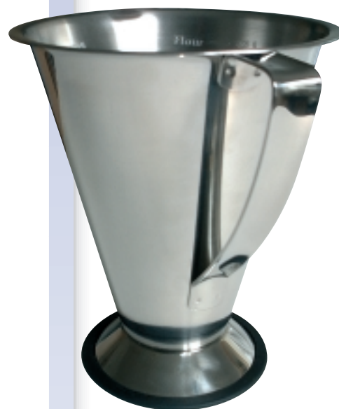
MEASURING JUG GL00-02-062